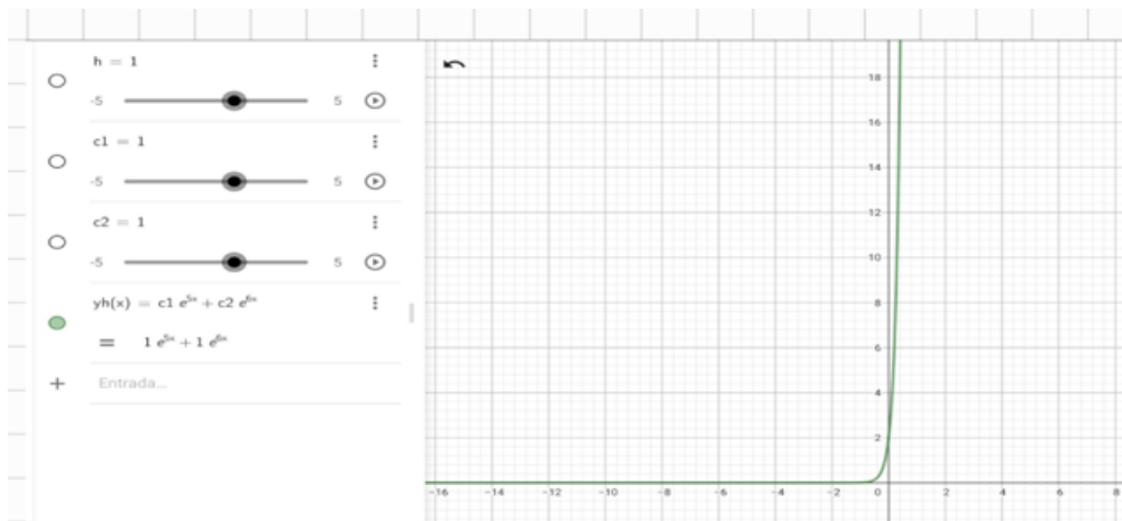
Figure 2. Adjustable parameters.